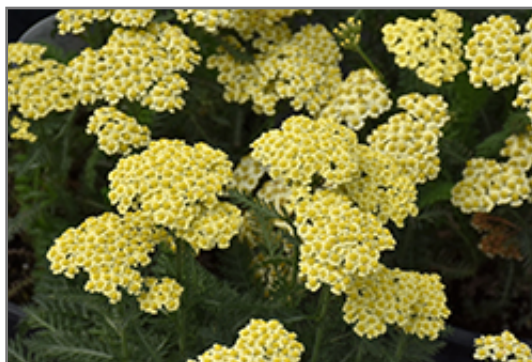
Sunny Seduction Yarrow flowers