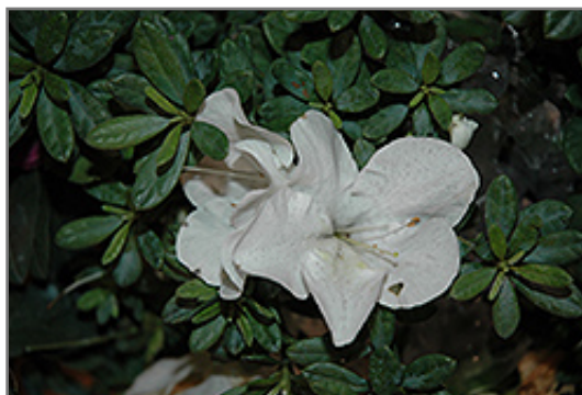
Bloom-A-Thon White Azalea flowers

Bloom-A-Thon White Azalea will grow to be about 30 inches tall at maturity, with a spread of 3 feet. It tends to be a little leggy, with a typical clearance of 1 foot from the ground. It grows at a slow rate, and under ideal conditions can be expected to live for 40 years or more.