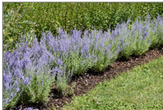
Lacey Blue Russian Sage in bloom