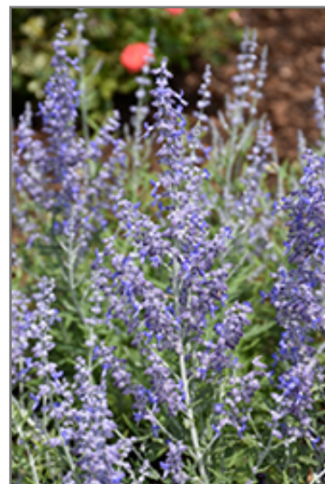
Lacey Blue Russian Sage flowers

Lacey Blue Russian Sage is recommended for the following landscape applications;