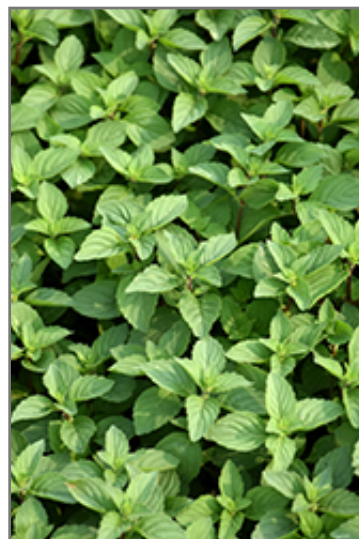
Ginger Mint foliage

Ginger Mint features bold spikes of violet tubular flowers with lavender overtones rising above the foliage from late summer to mid fall. Its attractive fragrant oval leaves remain green in color with showy yellow variegation throughout the season.