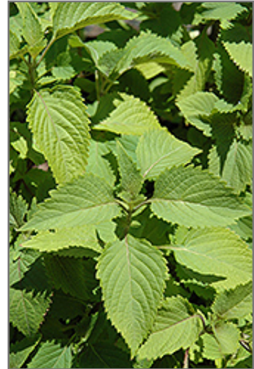
Ginger Mint foliage

Ginger Mint features bold spikes of violet tubular flowers with lavender overtones rising above the foliage from late summer to mid fall. Its attractive fragrant oval leaves remain green in color with showy yellow variegation throughout the season.