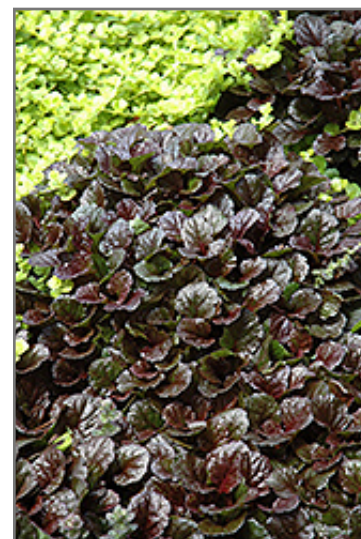
Black Scallop Bugleweed