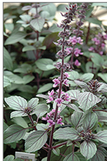
African Blue Basil flowers

This plant is quite ornamental as well as edible, and is as much at home in a landscape or flower garden as it is in a designated edibles garden. It should only be grown in full sunlight. It prefers to grow in average to moist conditions, and shouldn't be allowed to dry out. It is not particular as to soil type or pH. It is somewhat tolerant of urban pollution. This particular variety is an interspecific hybrid. It can be propagated by cuttings; however, as a cultivated variety, be aware that it may be subject to certain restrictions or prohibitions on propagation.