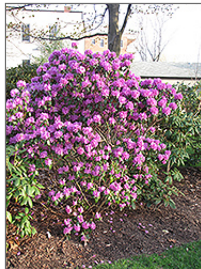
P.J.M. Regal Rhododendron in bloom