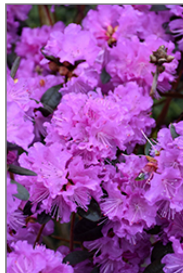
P.J.M. Regal Rhododendron flowers