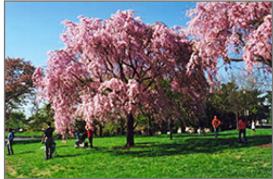
Pink Weeping Higan Cherry in bloom