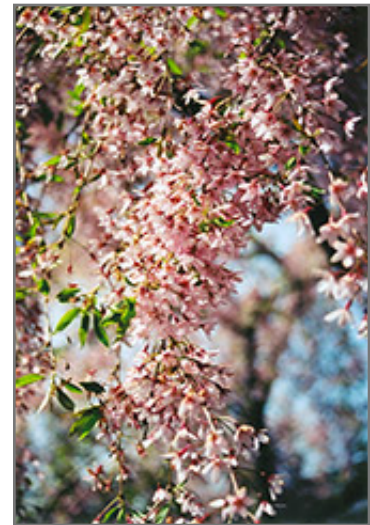
Pink Weeping Higan Cherry flowers