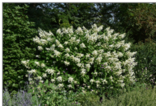
Pink Lady Hydrangea in bloom