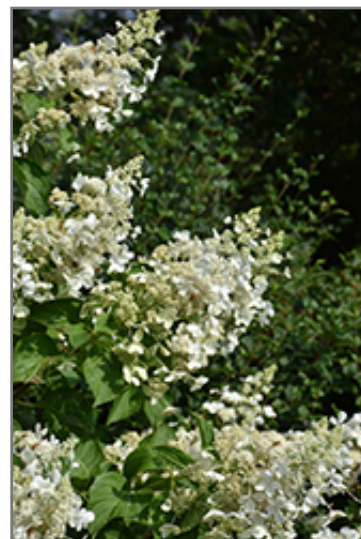
Pink Lady Hydrangea flowers