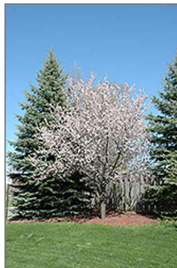
Newport Plum in bloom

This tree should only be grown in full sunlight. It does best in average to evenly moist conditions, but will not tolerate standing water. It is not particular as to soil type or pH. It is highly tolerant of urban pollution and will even thrive in inner city environments. This is a selected variety of a species not originally from North America.