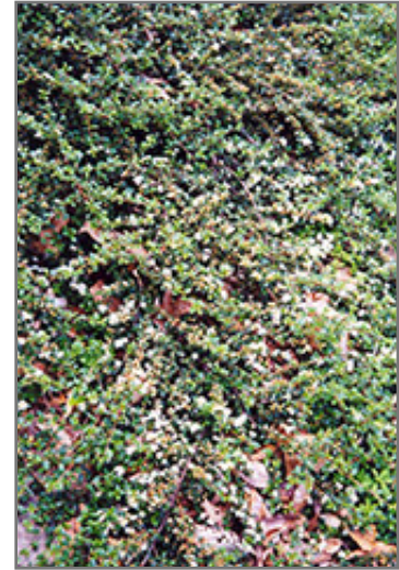
Spreading Cotoneaster

Spreading Cotoneaster will grow to be about 6 feet tall at maturity, with a spread of 7 feet. It tends to fill out right to the ground and therefore doesn't necessarily require facer plants in front, and is suitable for planting under power lines. It grows at a medium rate, and under ideal conditions can be expected to live for approximately 30 years.