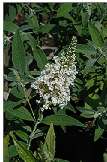
White Feather Butterfly Bush flowers