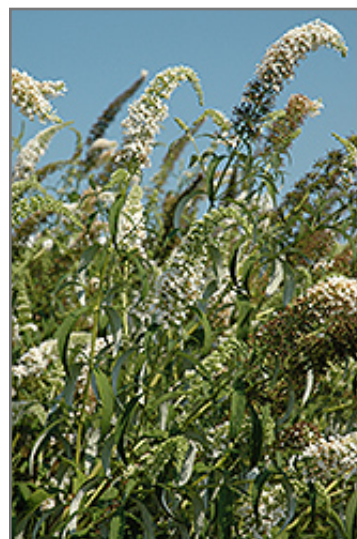
White Feather Butterfly Bush in bloom