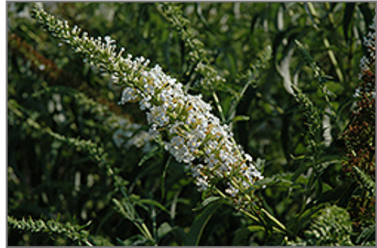
Snowbank Butterfly Bush flowers