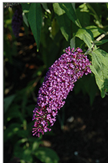
African Queen Butterfly Bush flowers