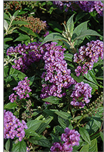
Lo And Behold Purple Haze Dwarf Butterfly Bush flowers