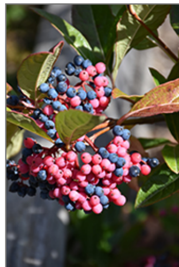
Brandywine Viburnum fruit

Brandywine Viburnum is recommended for the following landscape applications;