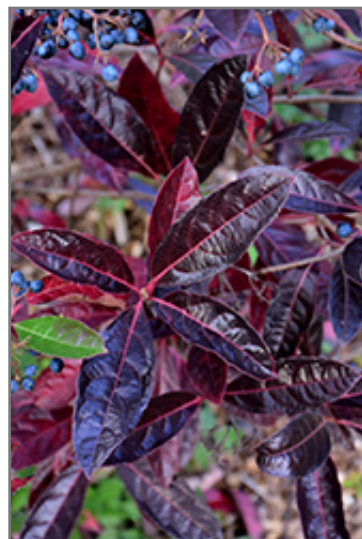
Brandywine Viburnum in fall

This shrub does best in full sun to partial shade. It prefers to grow in average to moist conditions, and shouldn't be allowed to dry out. It is not particular as to soil type or pH. It is highly tolerant of urban pollution and will even thrive in inner city environments. Consider applying a thick mulch around the root zone in winter to protect it in exposed locations or colder microclimates. This is a selection of a native North American species.