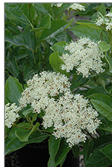
Brandywine Viburnum flowers