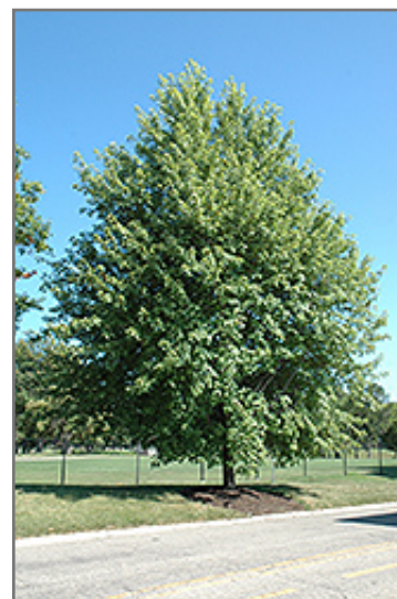
Autumn Fantasy Maple