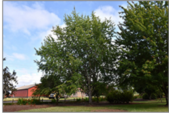
Autumn Fantasy Maple

This tree should only be grown in full sunlight. It is quite adaptable, preferring to grow in average to wet conditions, and will even tolerate some standing water. It is not particular as to soil type or pH. It is highly tolerant of urban pollution and will even thrive in inner city environments. This particular variety is an interspecific hybrid.