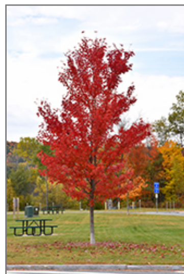
Autumn Fantasy Maple in fall