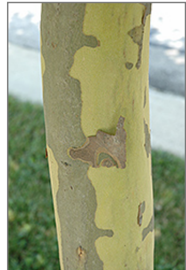
Bloodgood London Planetree bark