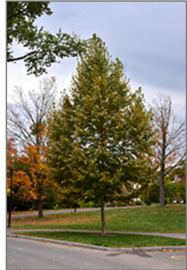
Bloodgood London Planetree