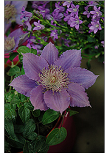
Bijou Clematis flowers

Bijou Clematis will grow to be about 24 inches tall at maturity, with a spread of 12 inches. As a climbing vine, it tends to be leggy near the base and should be underplanted with low-growing facer plants. It should be planted near a fence, trellis or other landscape structure where it can be trained to grow upwards on it, or allowed to trail off a retaining wall or slope. It grows at a medium rate, and under ideal conditions can be expected to live for approximately 20 years.