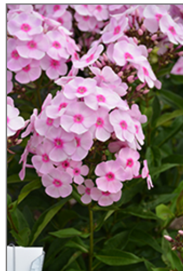
Bubble Gum Pink Garden Phlox flowers

Bubble Gum Pink Garden Phlox is recommended for the following landscape applications;