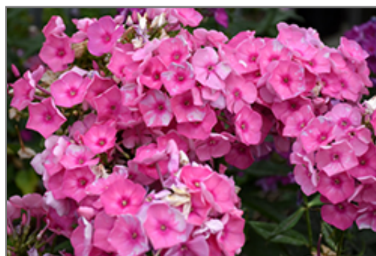
Bubble Gum Pink Garden Phlox flowers