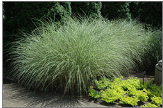
Morning Light Maiden Grass