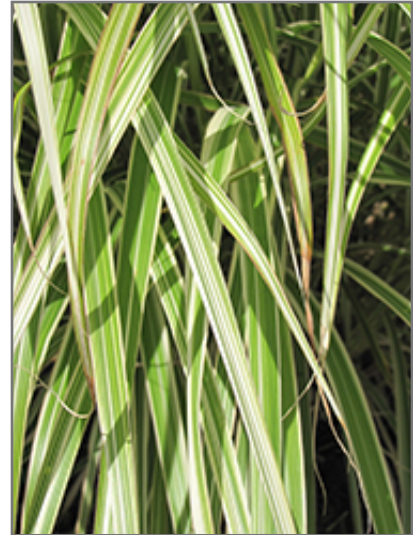
Morning Light Maiden Grass foliage

This plant does best in full sun to partial shade. It prefers to grow in average to moist conditions, and shouldn't be allowed to dry out. It is not particular as to soil type or pH. It is highly tolerant of urban pollution and will even thrive in inner city environments. This is a selected variety of a species not originally from North America. It can be propagated by division; however, as a cultivated variety, be aware that it may be subject to certain restrictions or prohibitions on propagation.