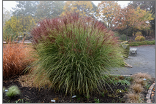
Morning Light Maiden Grass fruit

Morning Light Maiden Grass is recommended for the following landscape applications;