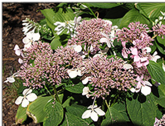
Mariesii Hydrangea flowers