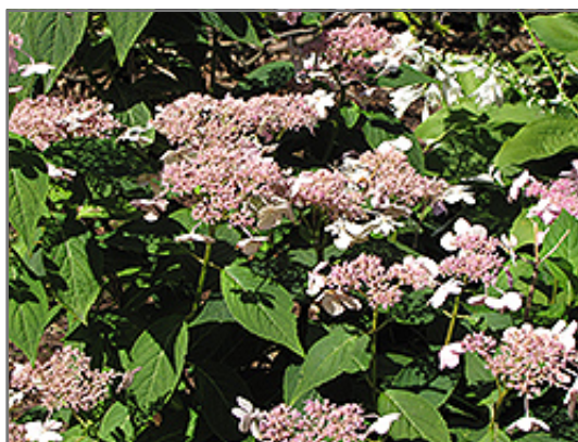
Mariesii Hydrangea in bloom