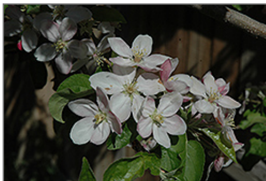
Jonathan Apple flowers