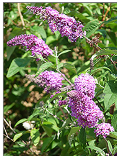
Niche's Choice Butterfly Bush flowers