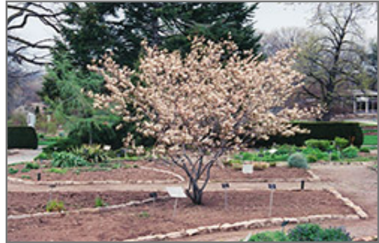
Shadblow Serviceberry (clump) in bloom

Shadblow Serviceberry (clump) is recommended for the following landscape applications;