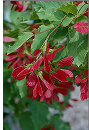
Hot Wings Tatarian Maple fruit