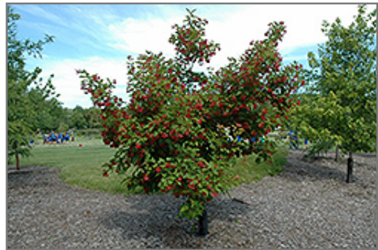
Hot Wings Tatarian Maple