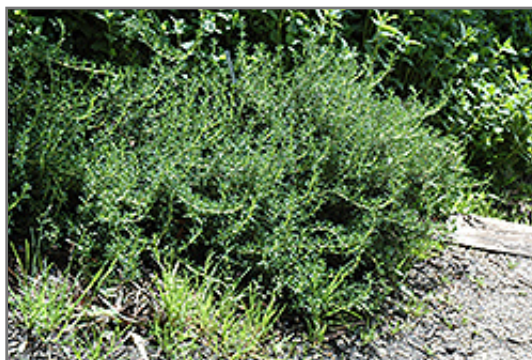
Lockwood de Forest Rosemary

This plant is quite ornamental as well as edible, and is as much at home in a landscape or flower garden as it is in a designated herb garden. It should only be grown in full sunlight. It prefers dry to average moisture levels with very well-drained soil, and will often die in standing water. It is not particular as to soil type or pH. It is highly tolerant of urban pollution and will even thrive in inner city environments. Consider applying a thick mulch around the root zone in winter to protect it in exposed locations or colder microclimates. This is a selected variety of a species not originally from North America.